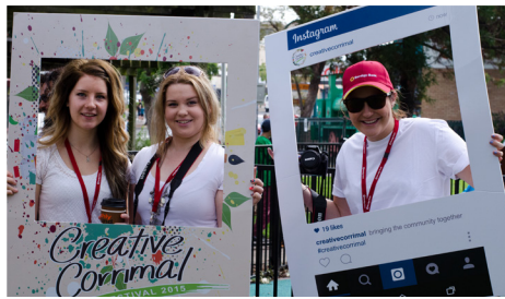
Creative Corrimal Arts Festival

Corrimal Chamber of Commerce, proudly serving businesses and communities in the Northern Illawarra since 1949. We also host Spring into Corrimal, which is now the largest one day free family festival in Regional NSW.