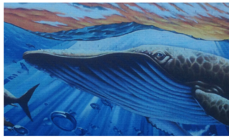
Mural at Memorial Park