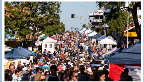
Spring into Corrimal

The Corrimal Chamber of Commerce was first established in 1949 - the longest established chamber of commerce within the Illawarra region. We have a strong membership base and are growing everyday in every way. There are over 3,000 businesses and 50,000 residents between Fairy Meadow and Thirroul. Most of our members are from the northern Illawarra but we also have members outside the area. The area we look after is from Fairy Meadow to Thirroul.