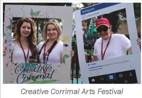
Creative Corrimal Arts Festival

Corrimal Chamber of Commerce, proudly serving businesses and communities since 1949. We host Spring into Corrimal - The largest one day free family festival in Regional NSW and are the NSW Business Chamber of the Year for 2018.