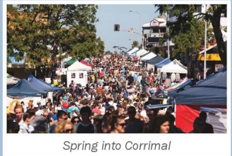
Spring into Corrimal

The Corrimal Chamber of Commerce was established in 1949 - the longest established Local Business Chamber within the Illawarra region. We have a strong membership base and are growing every day. Most of our members are from the Northern Illawarra but we also have many members outside this area.